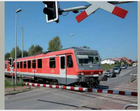
Level crossing with Sylomer® Rail Groove Fillers