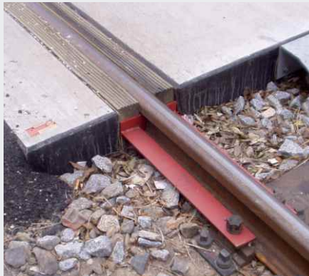
Installation in slab track

Getzner looking back on more than 30 years of positive experiences and satisfied customers.