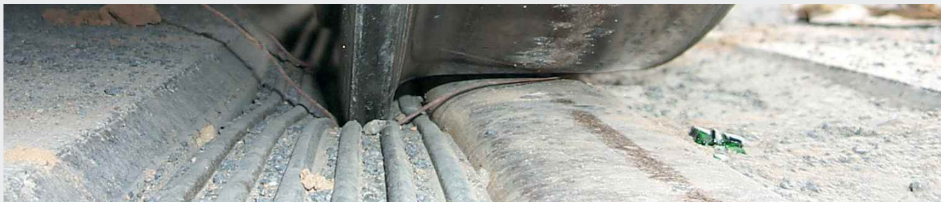
Installed Sylomer® Rail Groove Fillers with wheel flange