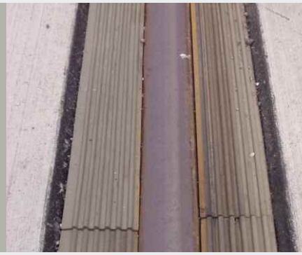
External groove and rail groove filler