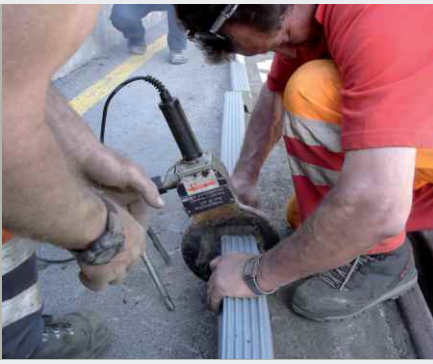
Welding the groove filler profiles together