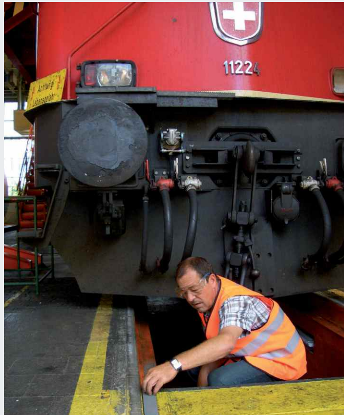
Sylomer® Rail Groove Fillers at the SBB workshop

Wherever street users and railway tracks meet, safety is the top priority. The groove between the rail and the guard rail or between the rail and the trackslab surface for level crossings and track systems represent a danger for pedestrians and single-tracked vehicles.