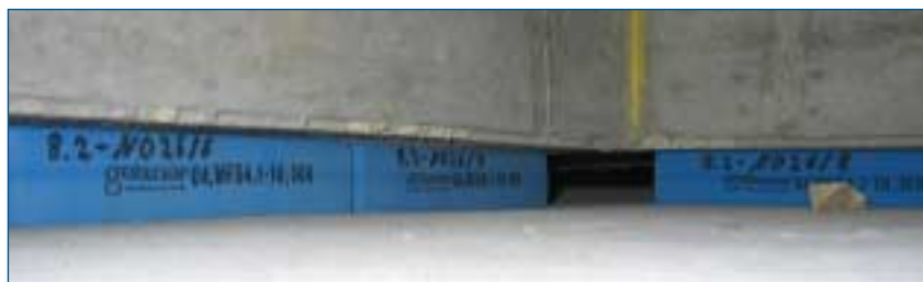
RIGHT After the bearings are installed, the slab is lowered into position so that the resilient elements can take the full load