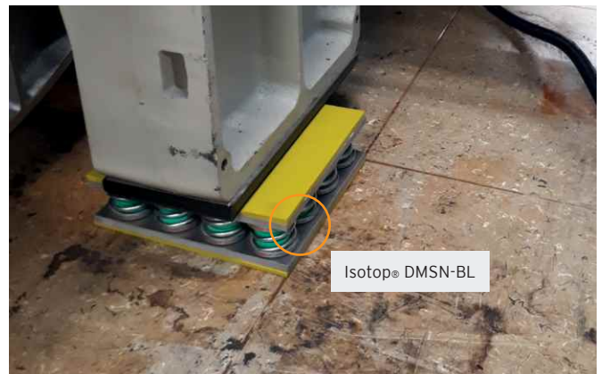
Isotop® DMSN-BL block element