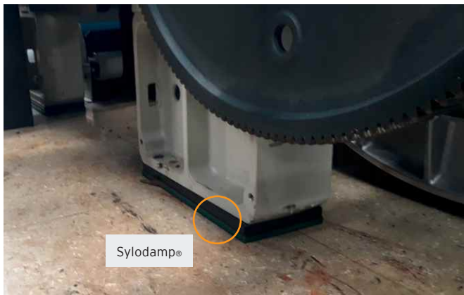
Elastic bearing made of Sylodamp®