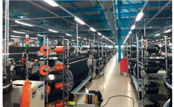
TFE weaving plant in Nüziders (Austria)

Austrian fabric manufacturer TFE - Textiles for Europe commissioned an external engineering firm to take vibration measurements on weaving machines (Picanol's OMNIplus Summum). The measurements show a significant improvement in the vibration-isolating effect of elastic loom bearings from Getzner Werkstoffe compared to the conventional cork bearings. Getzner offers both strip and point bearings made of Sylodamp® as well as compact Isotop® steel spring assemblies with integrated damping for the elastic bearing of looms.