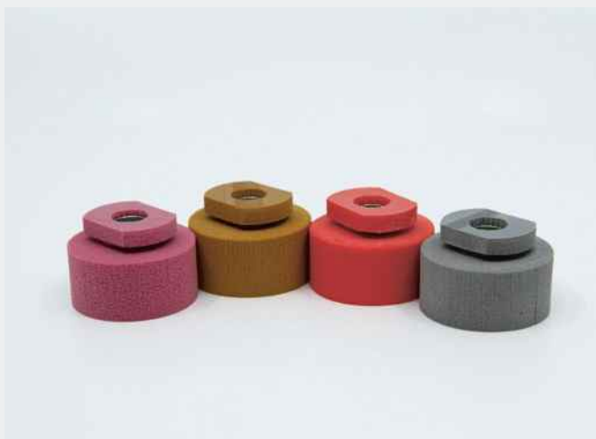
Sylomer ® Compressor Grommet CGR

Minimum order quantity of 1.000 units for bespoke orders