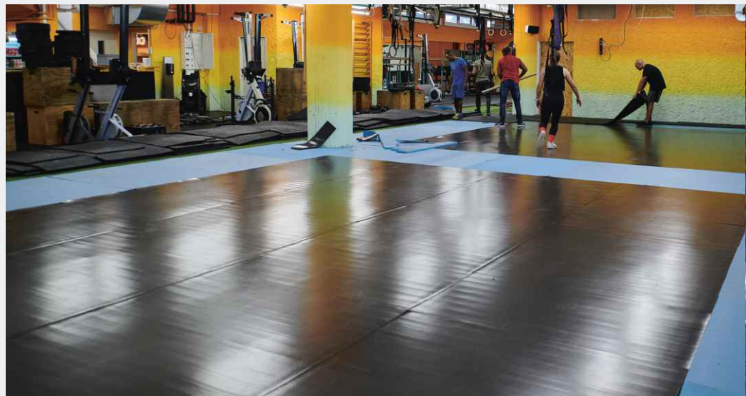
Bearing of the 220 m 2 free weights area

When using g-fit Shock Absorb there is no need to make any additional changes to the floor, so the bearing can easily be fitted retrospectively. The low installation heights mean that it can also be installed easily during